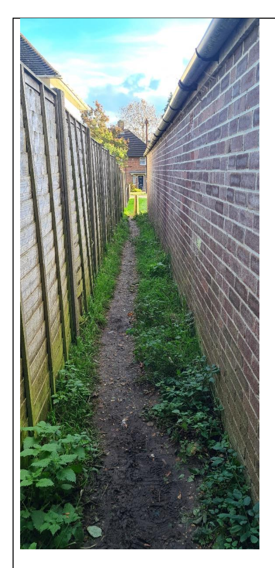
View of existing alley between garages and neighbouring property