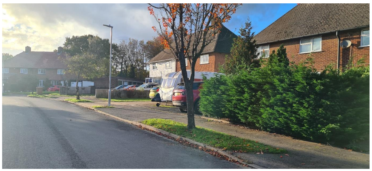
View south-west toward the site along The Queens Drive