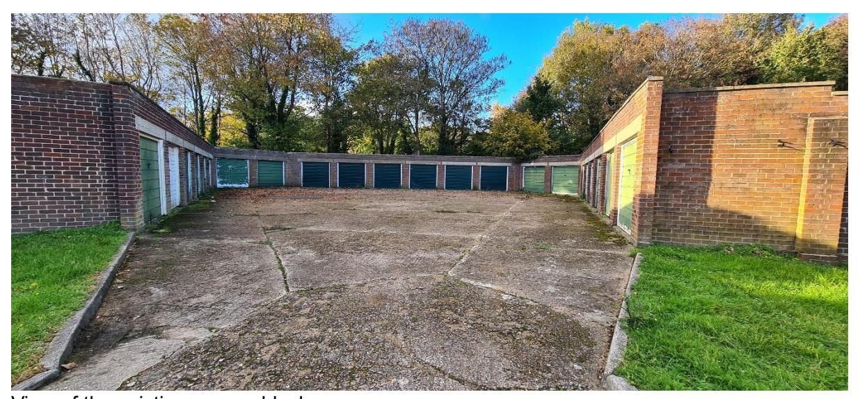
View of the existing garage blocks.