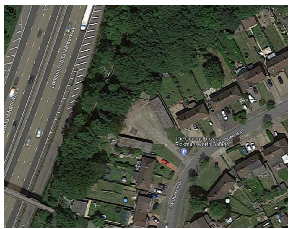
Google Aerial image showing the site relative to neighbouring buildings and the M25