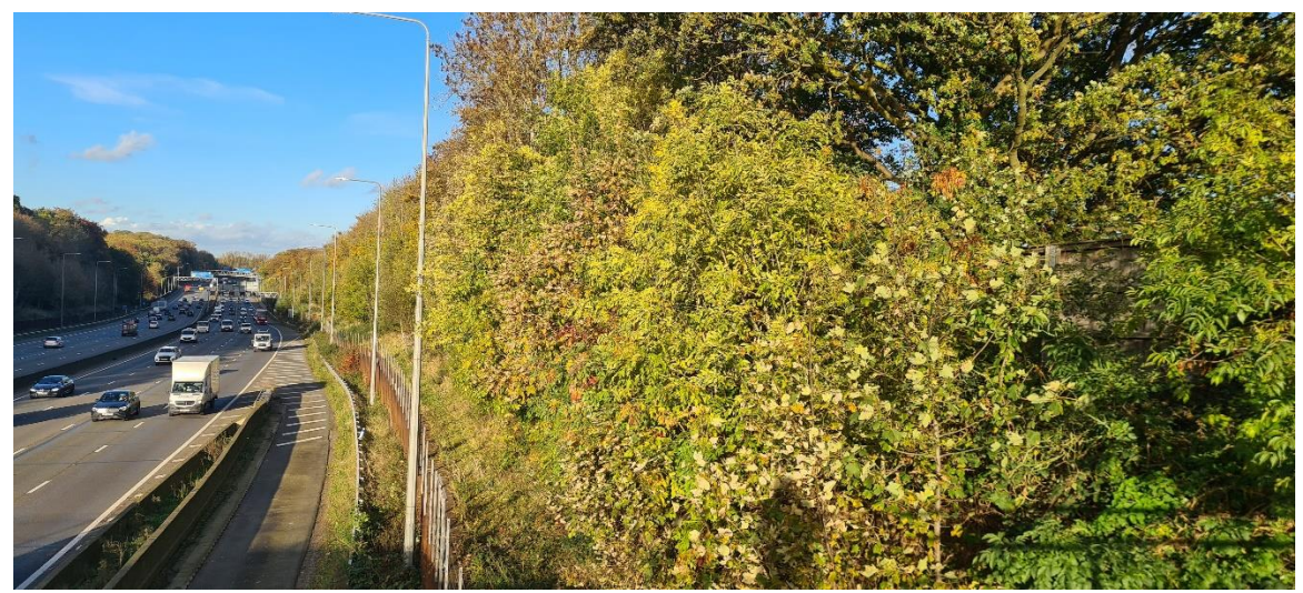
View of M25 showing it set at a lower level to the land on the right (beyond which sits the application site)