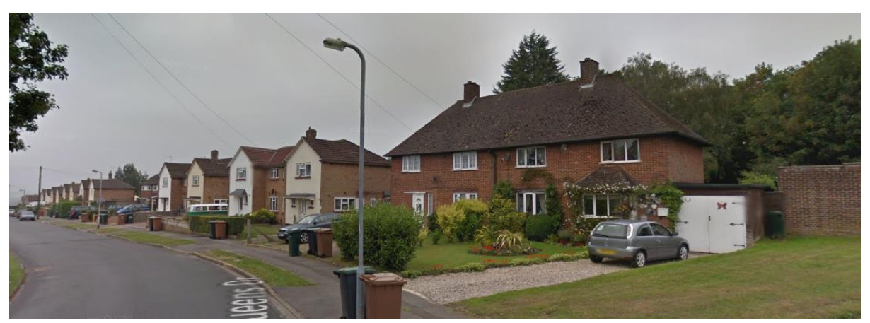
Image from Google street view with garage site on right <a href="https://maps.app.goo.gl/gMkALKR1Fwyv7rVH9">https://maps.app.goo.gl/gMkALKR1Fwyv7rVH9</a>