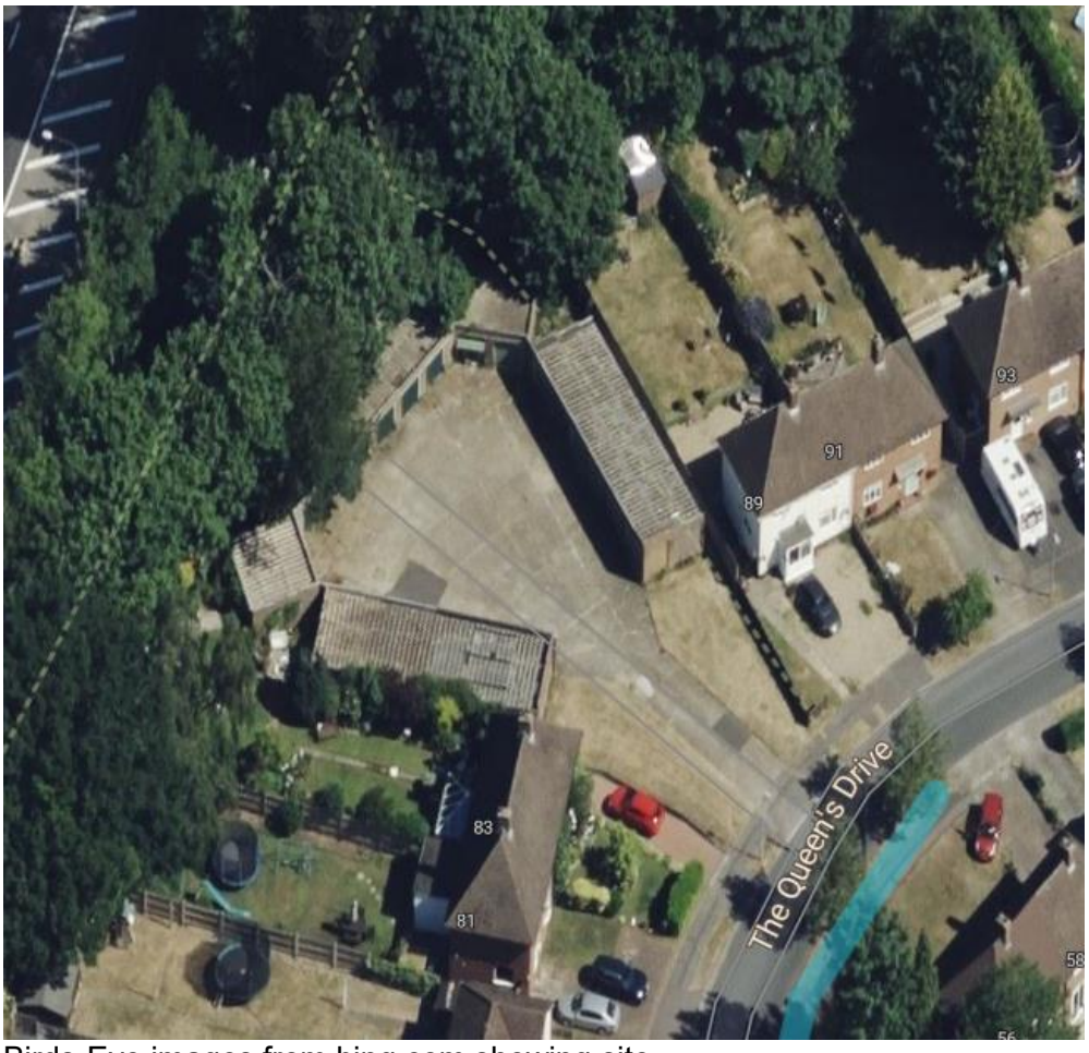
Birds-Eye images showing site